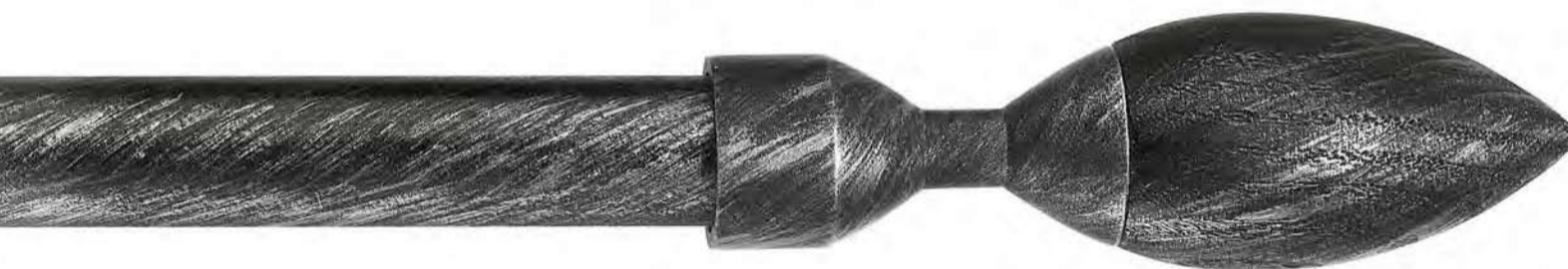
29= Nero argento Black silver Schwarz Silber Noir argent Negro plata

Terminali - Finials - Endstücke Embouts - Terminales