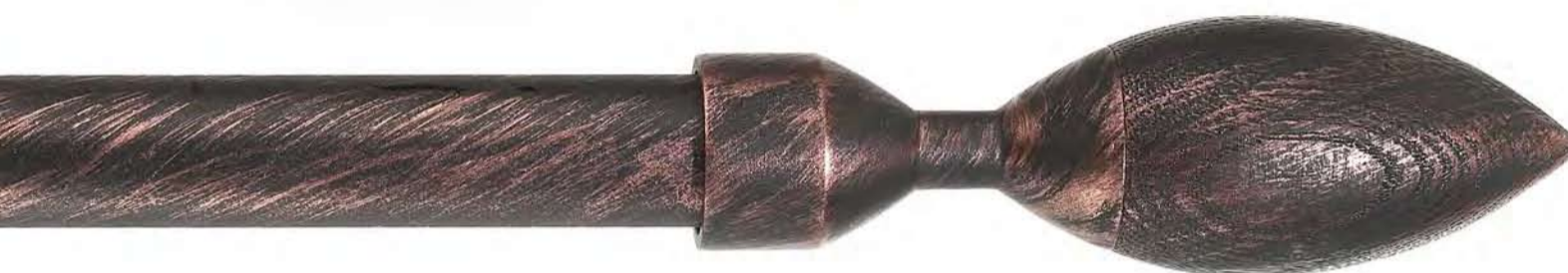
45= Nero ramato Black copper Schwarz Kupfer Noir cuivre Negro cobre