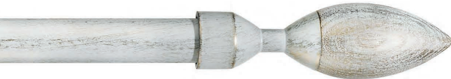
68= Bianco oro White gold Weiss gold Blanc or Blanco oro

Grandezza originale Actual size Originalgröße Grandeur originelle Tamaño natural